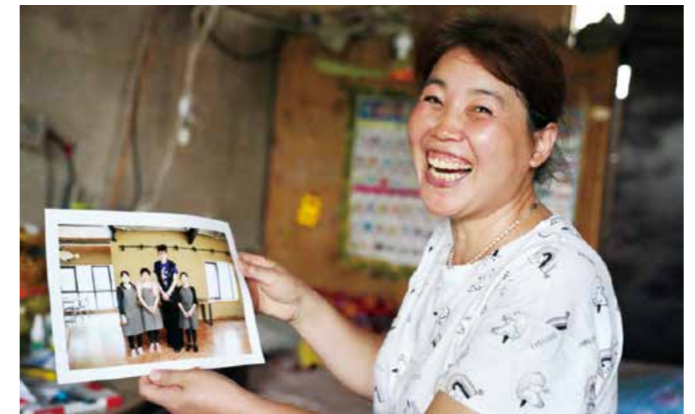
CNPC initiated a rural tourism project for poverty alleviation – "Vernacular B&B Town alongside Yellow River" in Jiangzhuang Village, Taiqian County, Henan Province. The project has brought a more attractive environment, smoother roads and better life to local residents.