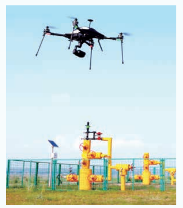
Routing inspection by drones at Changqing

Over the past two decades, we have created and applied 80 IT integrated systems covering production management, operation management, general management, infrastructure components and network security, marking two milestones in the company's IT capabilities, i.e. from distributed to centralized, and from centralized to integrated.